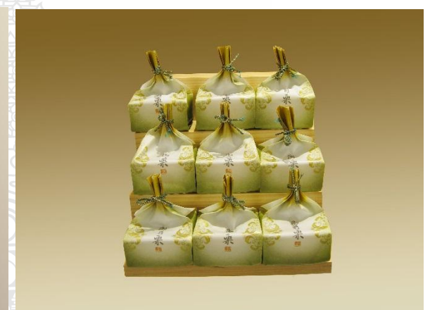
Fig. 6 Designs by shapes and styles.

all the materials of food package are now plastic through the world. Plastic materials have very bad influence on environment because they resist to be decomposed. "The white pollution" have been an issue through the world.