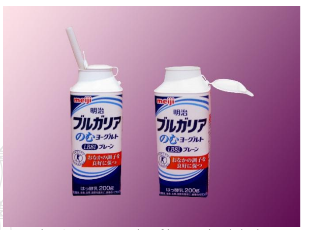
Fig. 4 An example of humanized design.