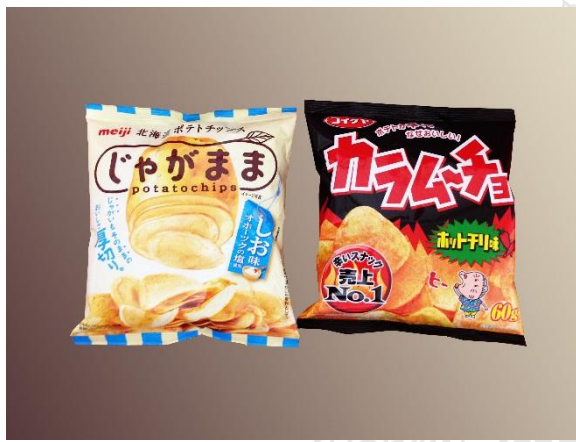
Fig. 5 Hot food (right) and salty food (left)