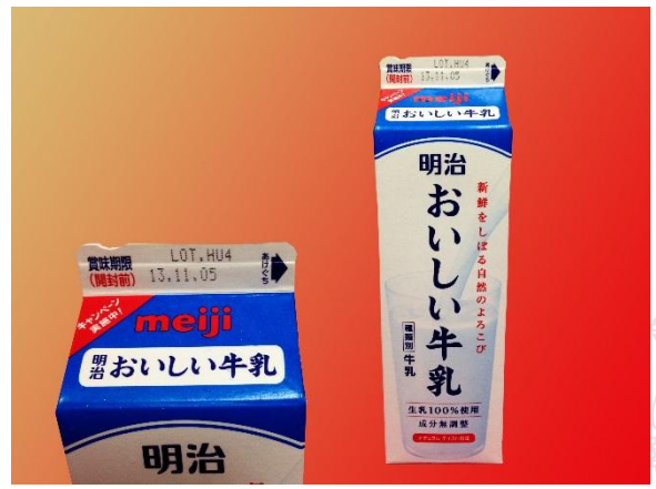
Fig. 3 The package of paper.