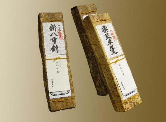
Fig.2 The package of bamboo