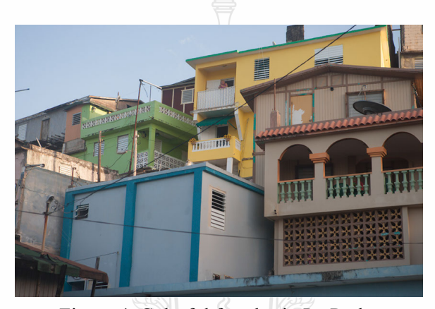
Figure 4. Colorful façades in La Perla.

According to table 1, the most commons colors on the dwelling of La Perla are: blue (26%), green (18.5 %) and yellow (16%). Jointly orange, red and pink comprise of 20.5% of the dwellings. The percentage of white, the most common color in the rest of the city of San Juan, is a mere 15% in La Perla. Tourists visiting La Perla for the first time are always impressed by the presence of bright colors in the neighborhood. As evidenced in table 1, with the exception of the 15% of white dwellings, the majority of dwellings are in color and many of those colors are bright. (Fig.4). Apart from the colorful dwelling façades of La Perla, the sector also has many public areas covered by murals. The strong presence of artists in La Perla has always generated the production of art.