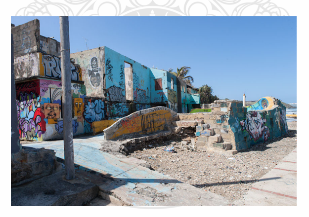
Fig. 2. Graffiti's in La Perla abandoned dwellings.

La Perla has been traditionally inhabited by artists. Several popular singers and musical groups were born in La Perla, which also boasts many plastic artists. This fact has transformed La Perla from a crowded poor neighborhood of dilapidated wood houses during the 50's to the colorful community it is today. Most of the houses in La Perla are lively, painted and colorful murals occupy the surfaces of most of the neighborhood community areas. To the surprise of visitors many urban elements in the neighborhood are painted, abandoned houses, dwelling roofs, the floor of the basketball court: anything can be transformed into a canvas. (Fig.2) The colorful neighborhood could be the perfect complement to the historical buildings of Old San Juan.