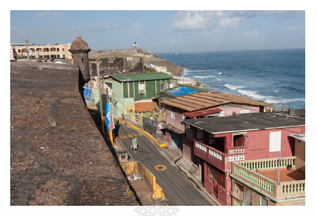
Fig. 1. La Perla is located between the city ramparts of Old San Juan and the ocean.

painted in bright colors. [4]. Colorful paint will not improve the dwellings, however, in the case of La Perla the use of color is not generated by an external funds but is part of the artistic idiosyncrasy of the inhabitants.