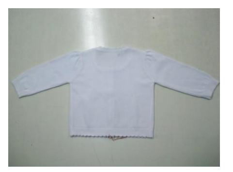
Figure 1:Prepare of sample to measure