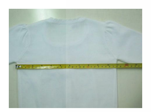
Figure 3 : Chest width