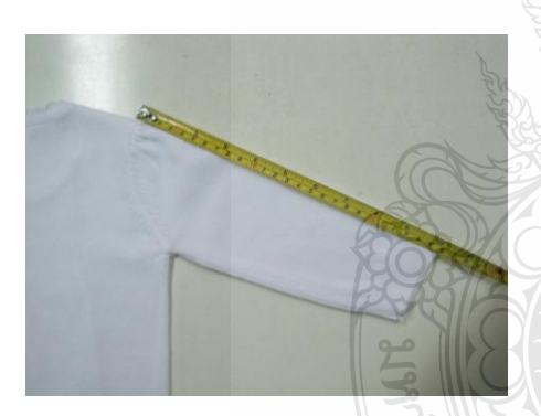
Figure 5 : Sleeve length