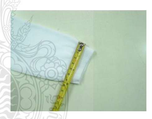
Figure 6 : Sleeve hem width