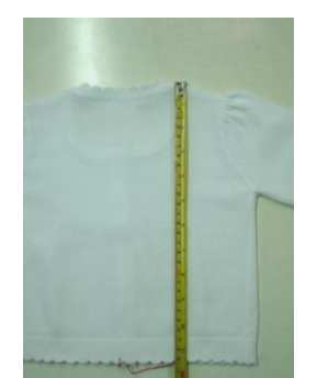
Figure 2 : Back length