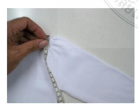
Figure 7 : Armhole width